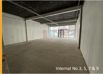
Internal No.3, 5, 7 & 9