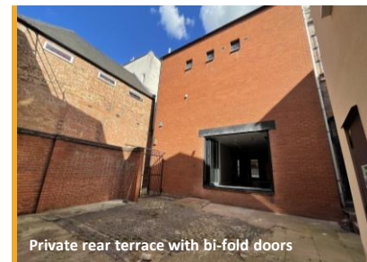
Private rear terrace with bi-fold doors