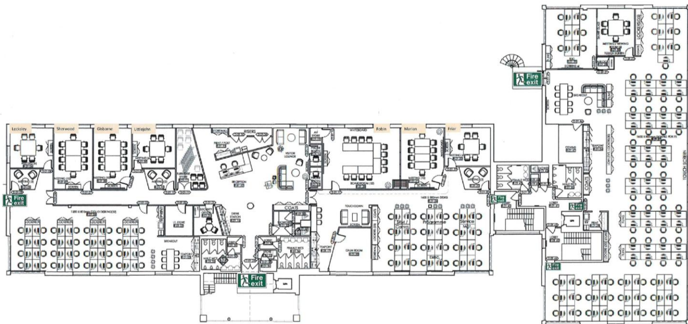
Existing Fit Out Plan