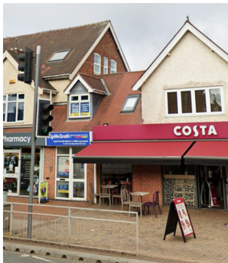
The Local Area