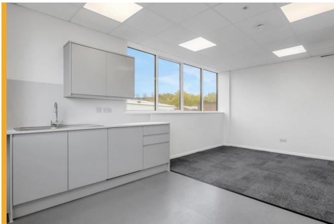
Photographs of the recent refurbishment completed at Unit 8