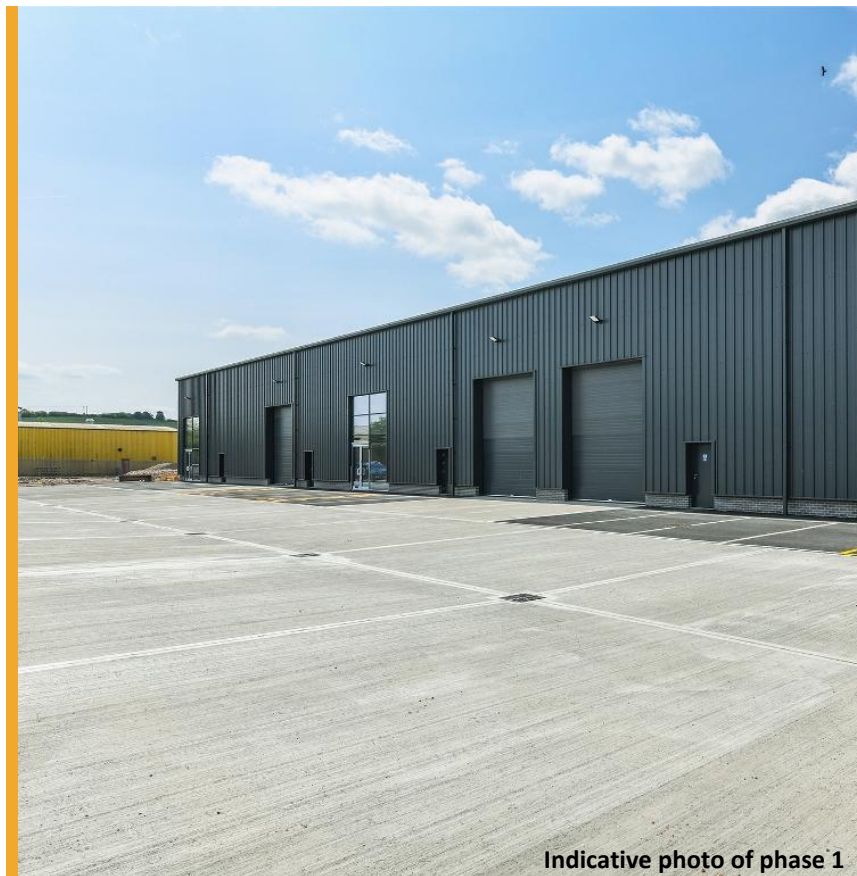
Indicative photo of phase 1