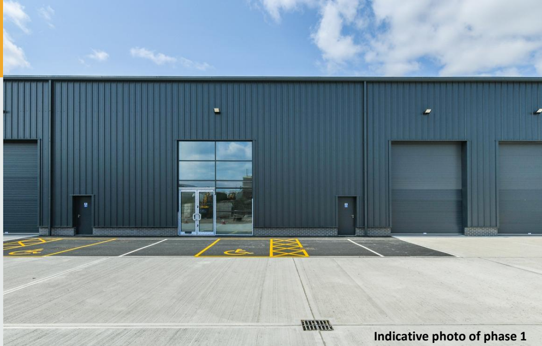
Indicative photo of phase 1