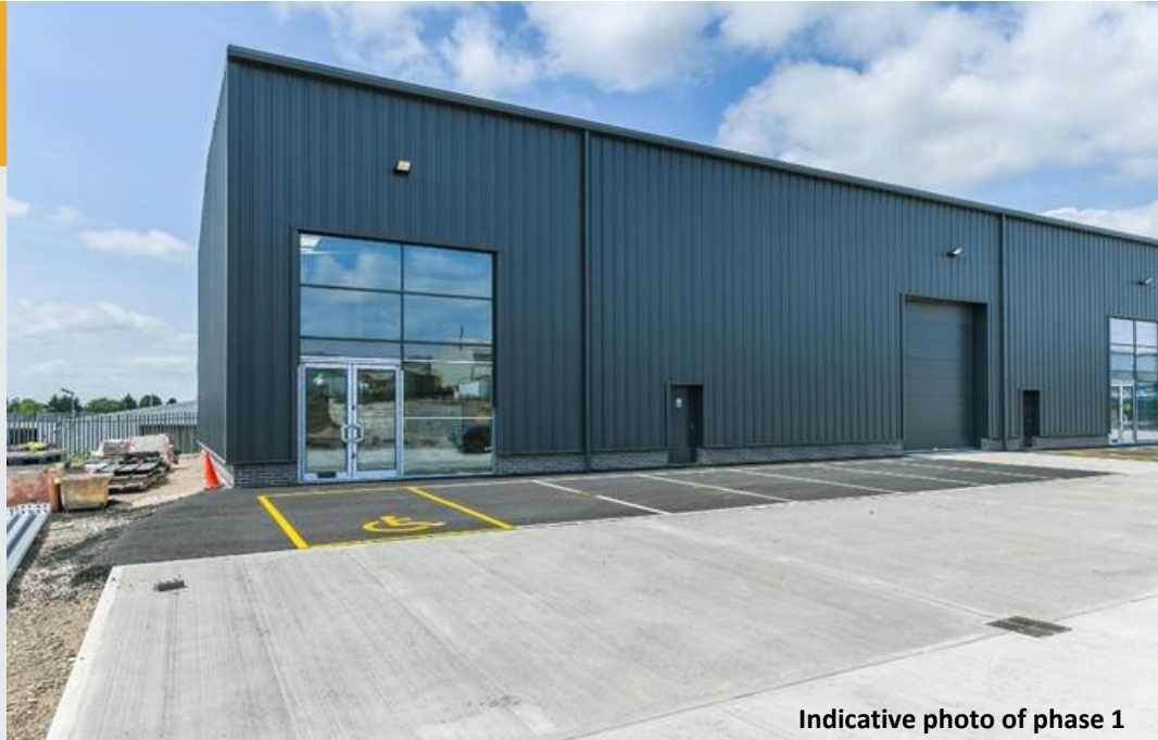
Indicative photo of phase 1