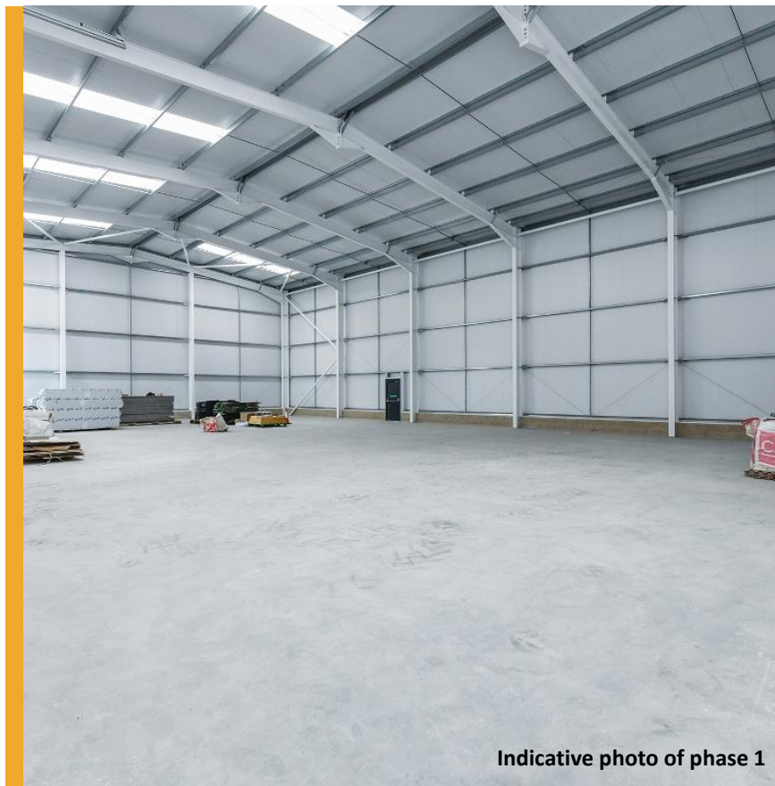
Indicative photo of phase 1