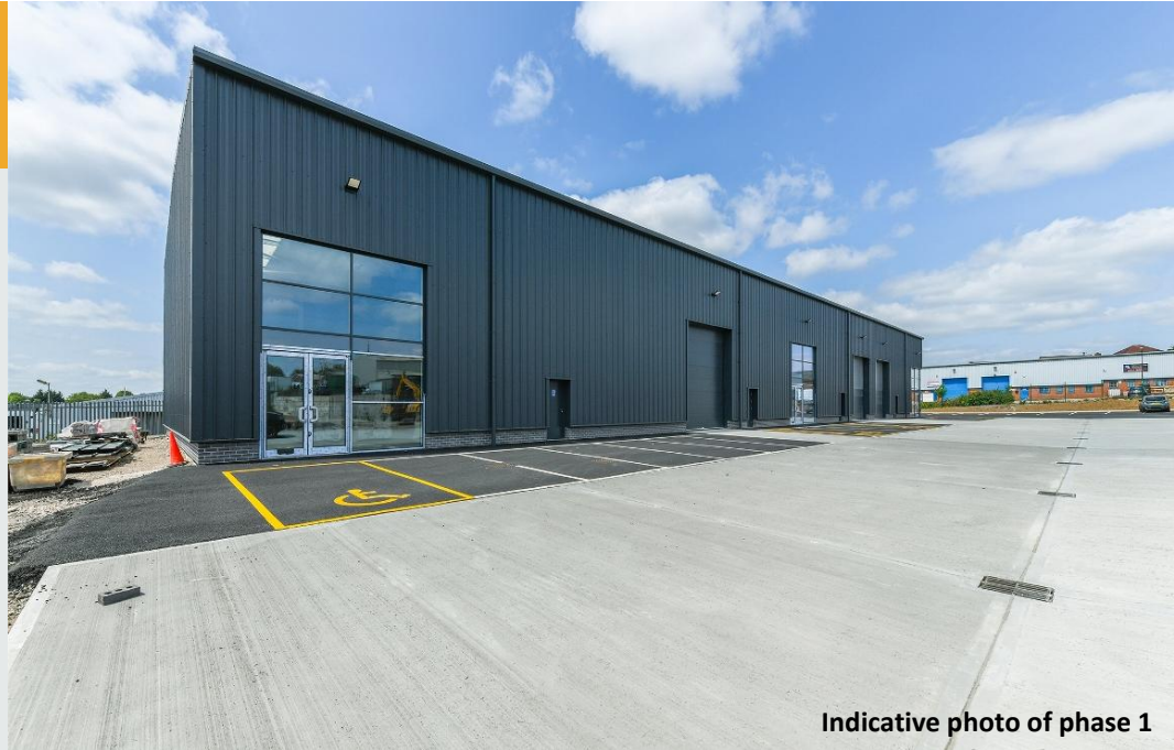
Indicative photo of phase 1