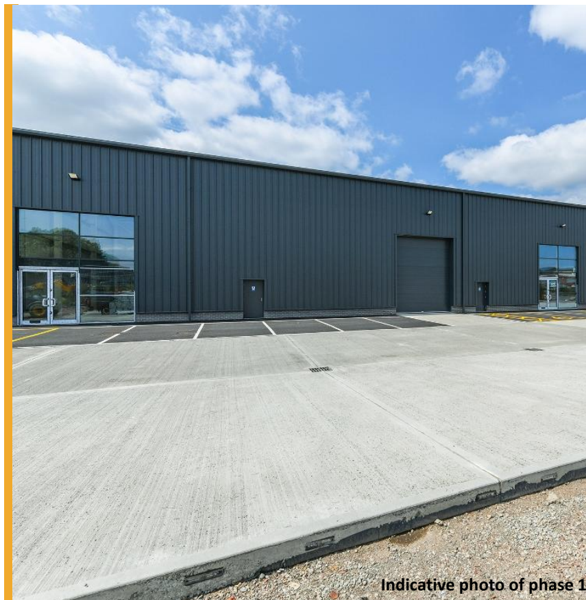
Indicative photo of phase 1