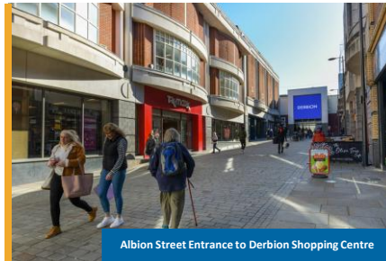
Albion Street Entrance to Derbion Shopping Centre