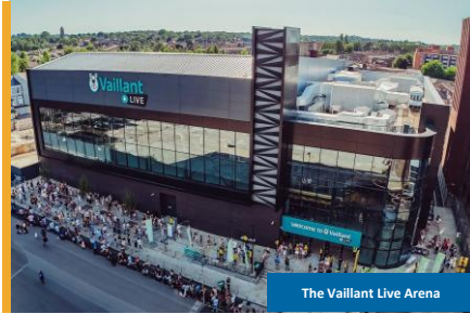
The Vaillant Live Arena