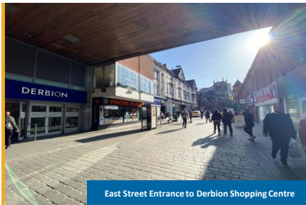
East Street Entrance to Derbion Shopping Centre