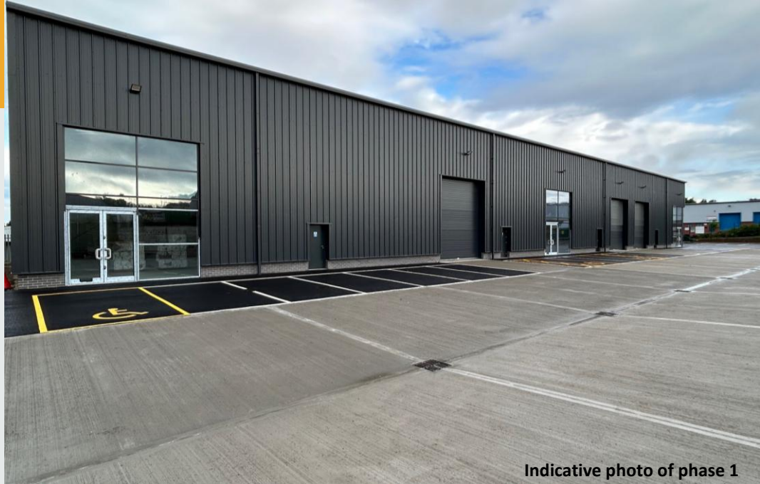
Indicative photo of phase 1