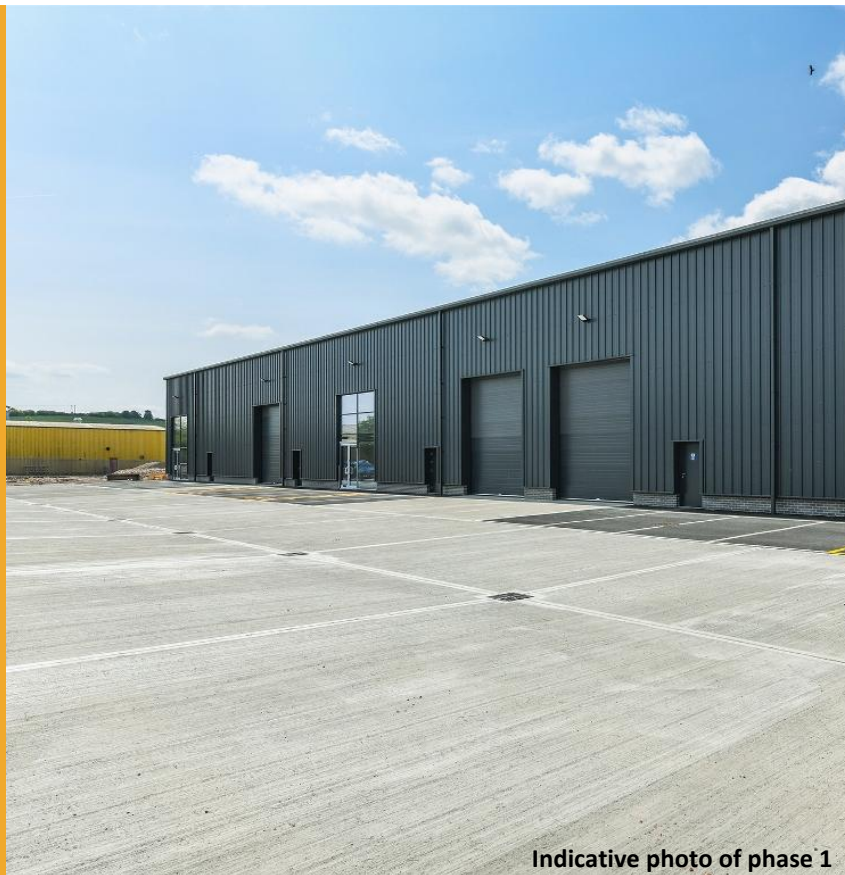
Indicative photo of phase 1